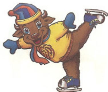
Figure skating has been included at every Arctic Winter Games except for the 2002 Games.

It is usually a female-only event featuring competition in both short and long programs.